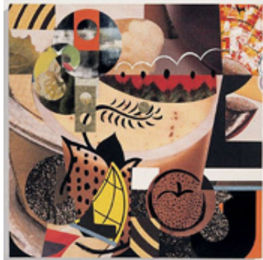
Roy Dowell Untitled #469 1990 Margo Leavin Gallery