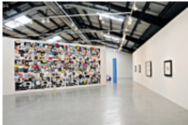
Installation view of "Allen Ruppertsberg: You and Me or The Art of Give and Take," 2009 Santa Monica Museum of Art