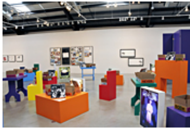
Installation view of "Allen Ruppertsberg: You and Me or The Art of Give and Take," 2009 Santa Monica Museum of Art