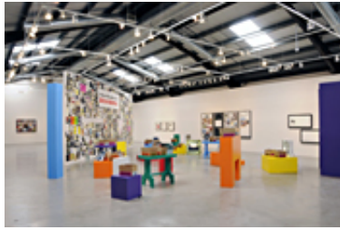
Installation view of "Allen Ruppertsberg: You and Me or The Art of Give and Take," 2009 Santa Monica Museum of Art