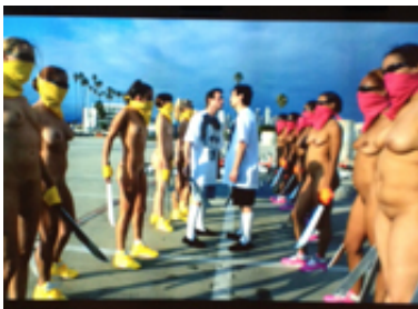
A scene from Harmony Korine's Caput in "Rebel"