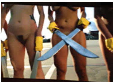
A scene from Harmony Korine's Caput in "Rebel"