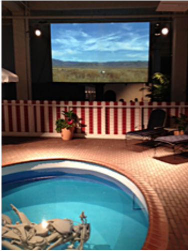
The poolside view of Aaron Young's installation in "Rebel"