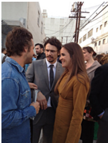
James Franco and friends at the opening of "Rebel" in Hollywood on May 11, 2012