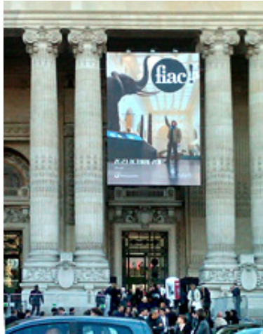
FIAC 2011 at the Grand Palais