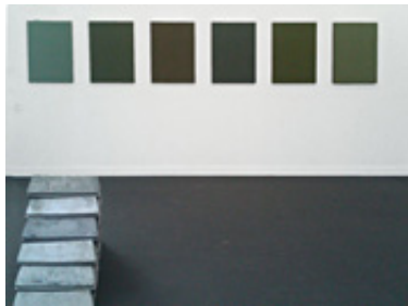
Works by Carl Andre (left foreground) and Sherrie Levine at Paula Cooper Gallery at FIAC 2011