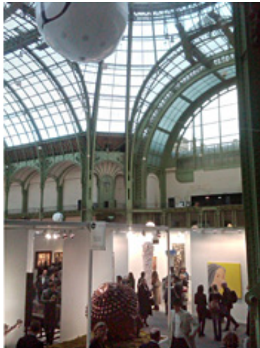
Inside FIAC 2011 at the Grand Palais