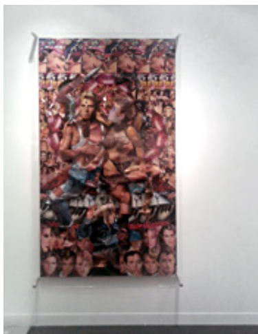
Robert Heinecken at Cherry and Martin at FIAC 2011