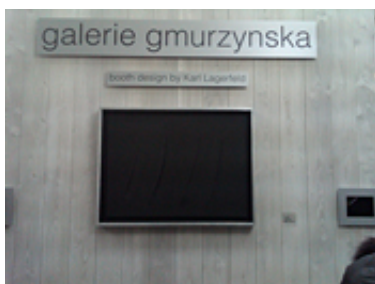
Lucio Fontana at Galerie Gmurzynska at FIAC 2011