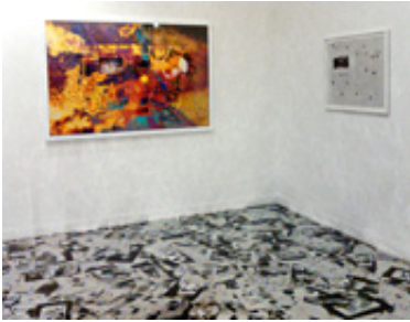
Carter Mull at Marc Foxx at FIAC 2011