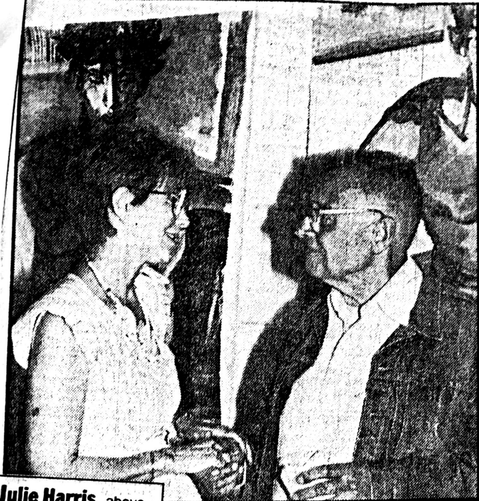
Julie Harris , above left, reunited with Christopher Isherwood, above right, at Don Bachardy's opening. Harris starred in the stage adaptation of the writer's Berlin stories. Buck Henry, right, also made the opening.