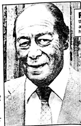
Rex Harrison couldn't attend the play because he was appearing in "Aren't We All?" But he made the party.