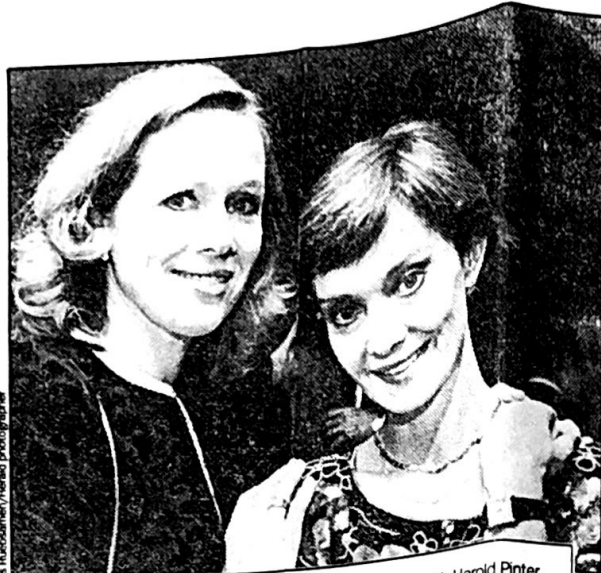
Liv Ullmann , left, and Nicola Pagett star, along with Harold Pinter, in Pinter's play "Old Times."